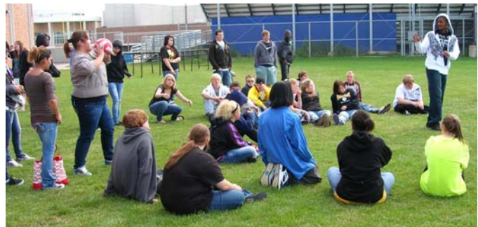
Students gather in advisories to participate in the “Time Ball” challenge