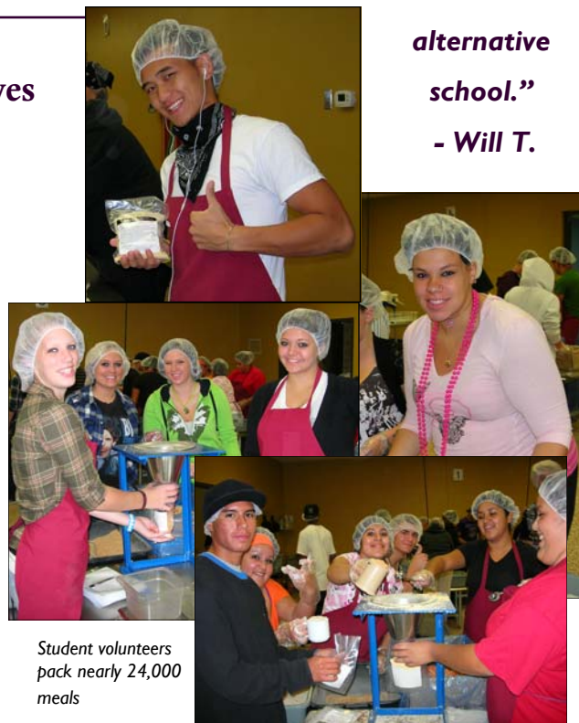
Student volunteers pack nearly 24,000 meals

For more information of FMSC check out: http://www.fmsc.org